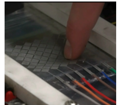
Capacitive Touch Sensor